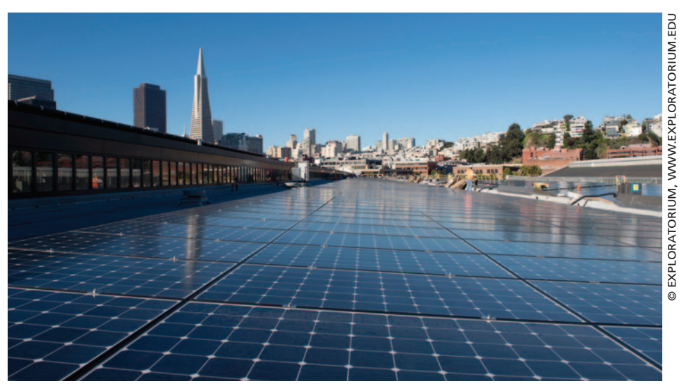
Photovoltaic array on Pier 15.

IAMFA members who attended the Pittsburgh conference in 2019 may remember the Exploratorium presentation called "Zero Net Energy is a Process Not an Endpoint."* The presentation was about the sustainable features of Pier 15, including our photovoltaic array and our goal of Zero Net Energy (ZNE). By 2019, we had achieved up to 80 percent ZNE, and in the presentation, we discussed