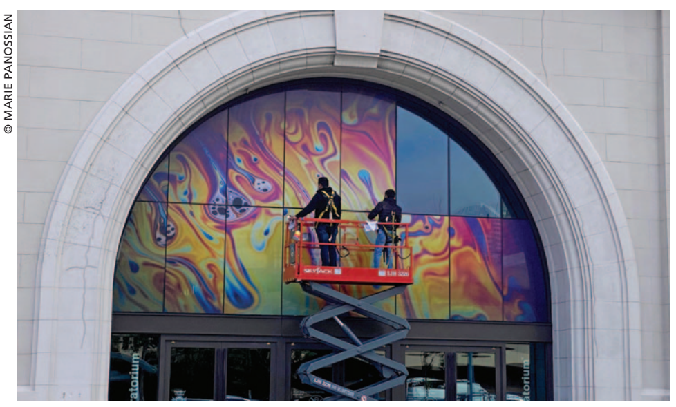
Exploratorium preparing for reopening with new window graphics.

Economizers were disabled to maximize fresh air. The ventilation system in our LEED Platinum building at Pier 15 had already been using MERV 13 filters and supplied 100 percent outside air to most spaces. We upgraded to MERV 14 filters at Pier 15. We also supplied portable air filters in the unimproved, back-of-house Pier 17 spaces. Staff members were encouraged to wear better-quality masks throughout.