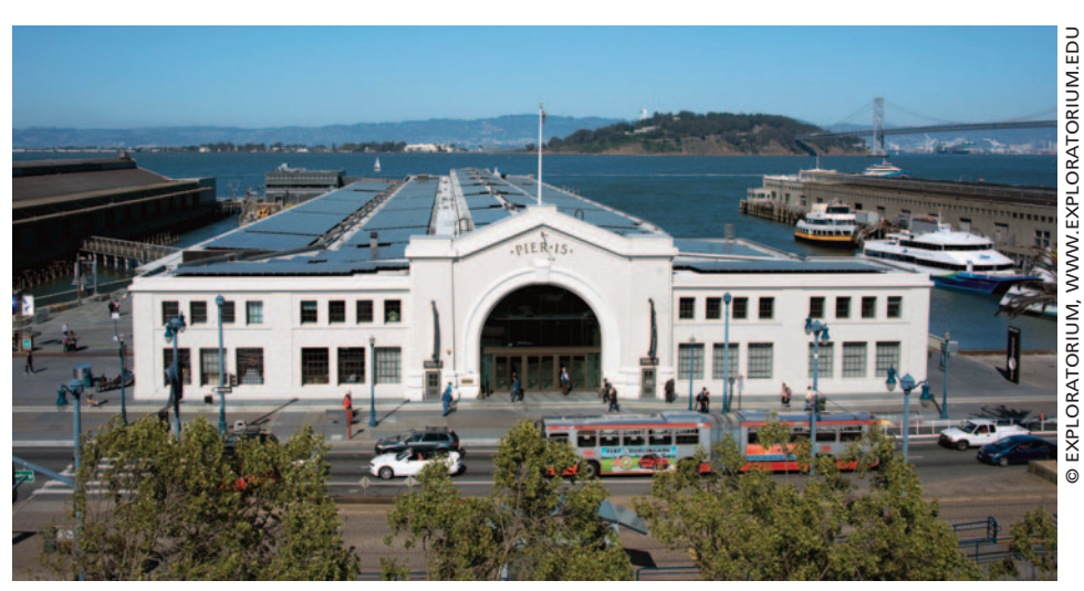
The Exploratorium at Pier 15.

When the Exploratorium shut down, our facilities technicians used wellknown best practices to conserve energy: setpoints for the heating and cooling system were (mostly) broadened from a 5-degree band to a 10-degree band, and lighting and ventilation schedules were minimized to accommodate the